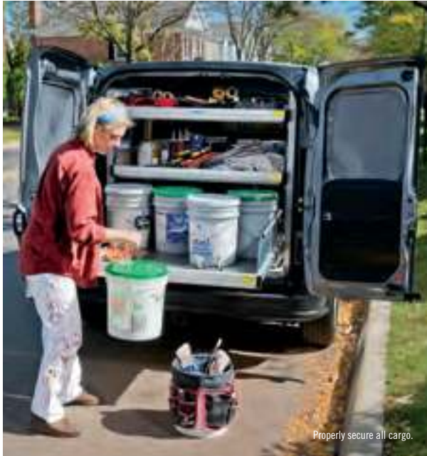
Properly secure all cargo.