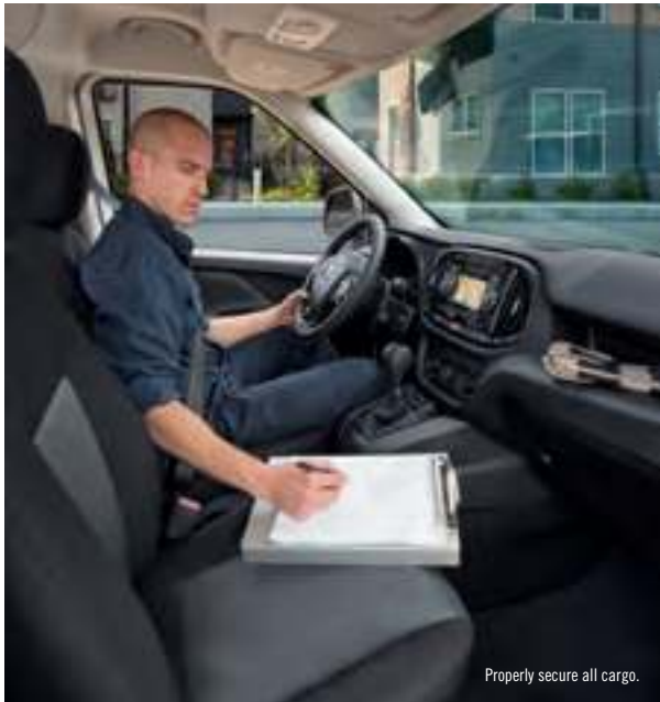
Properly secure all cargo.