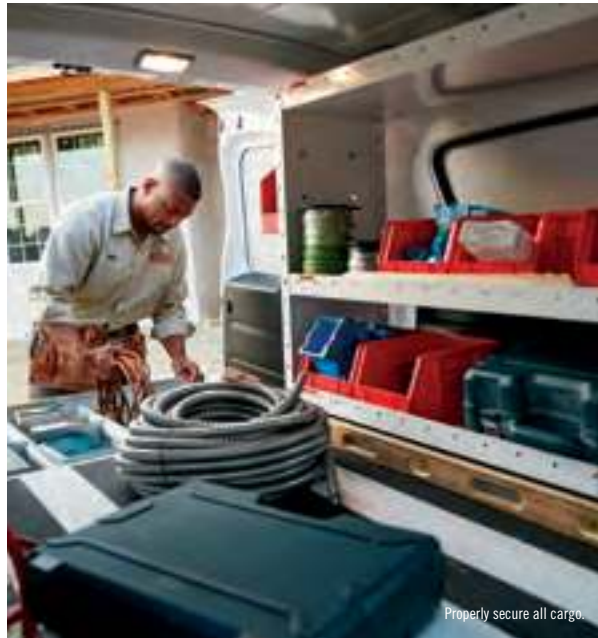
Properly secure all cargo.