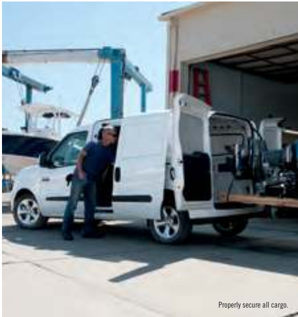
Properly secure all cargo.