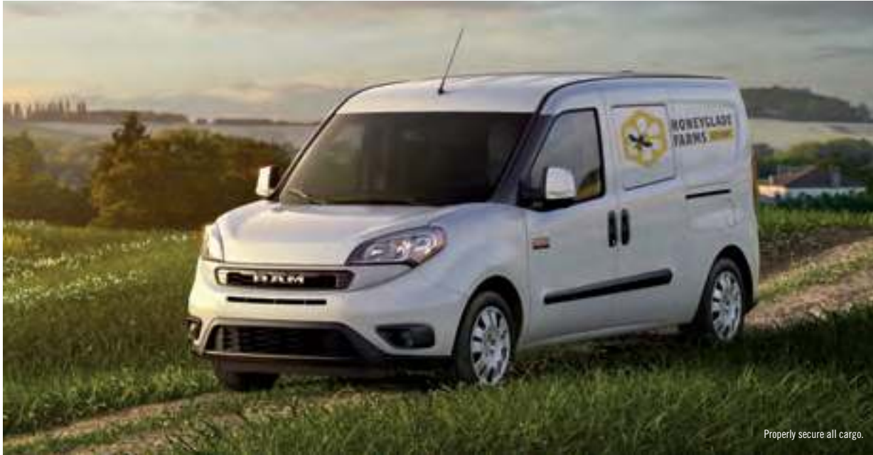
Properly secure all cargo.