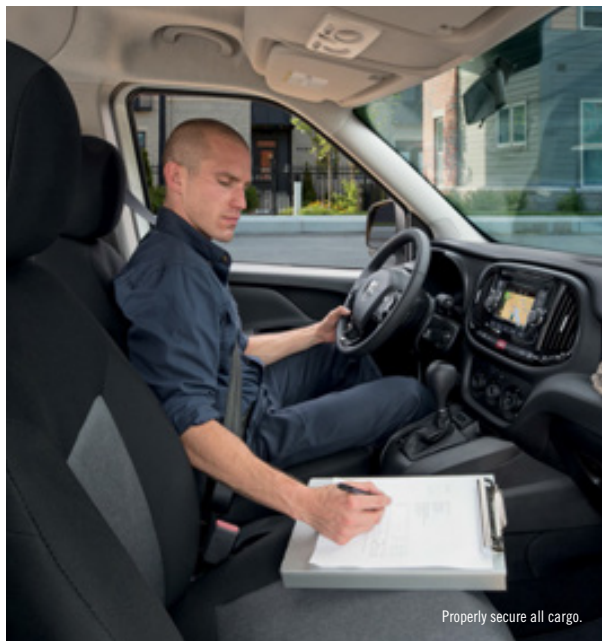
Properly secure all cargo.