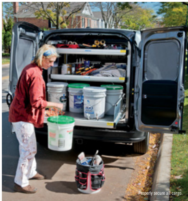
Properly secure all cargo.