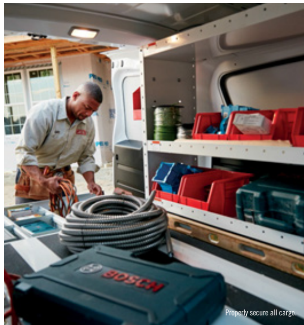
Properly secure all cargo.