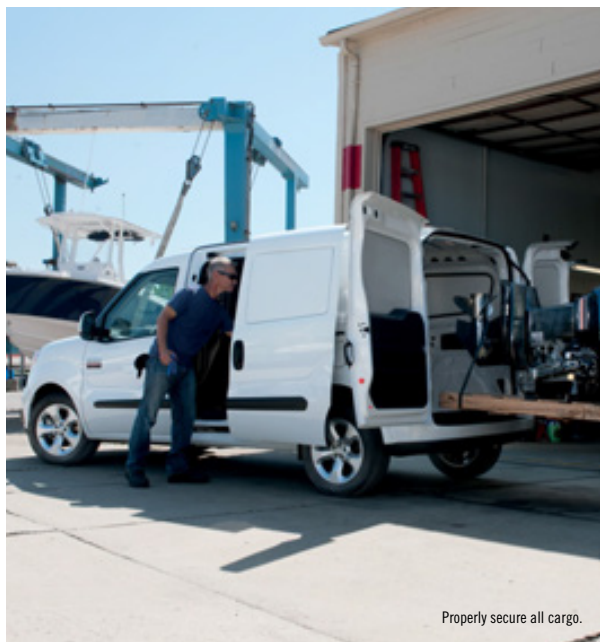
Properly secure all cargo.