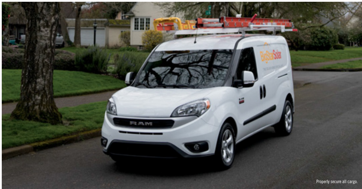
Properly secure all cargo.