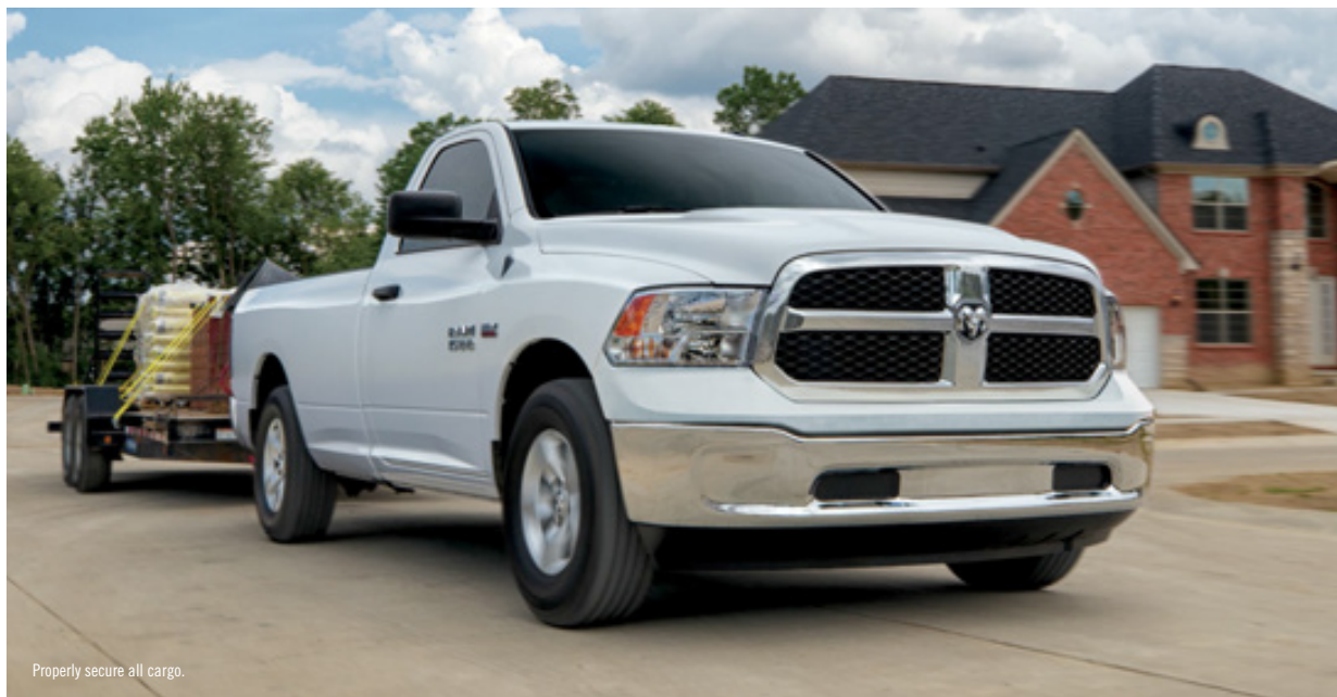
Properly secure all cargo.