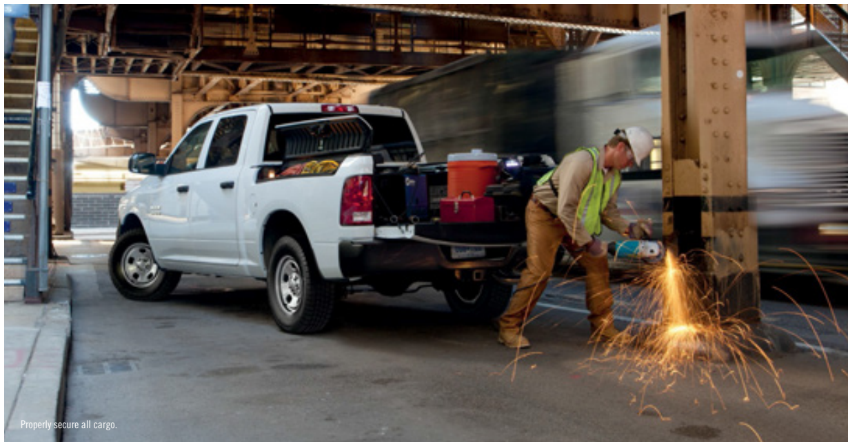
Properly secure all cargo.