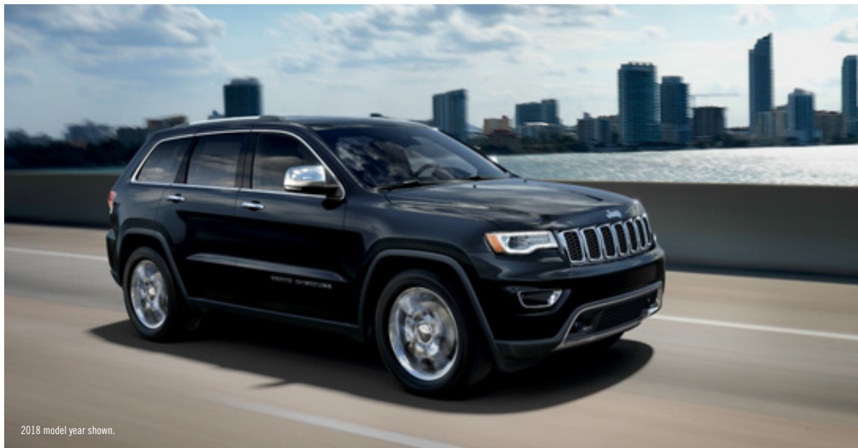
2018 model year shown.