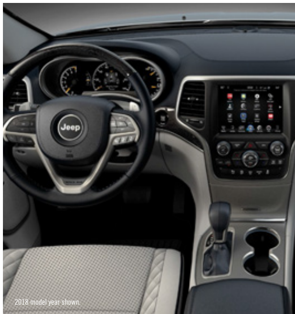
2018 model year shown.