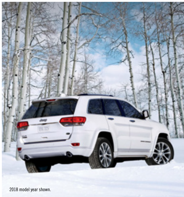
2018 model year shown.