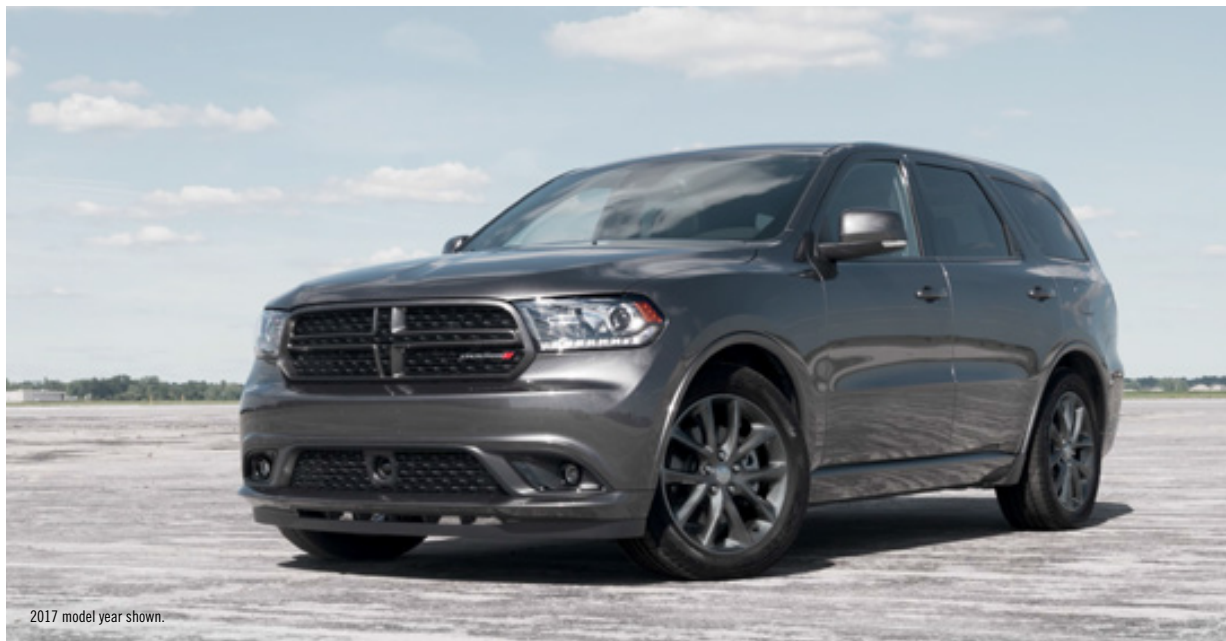
2017 model year shown.