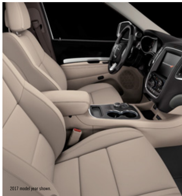
2017 model year shown.