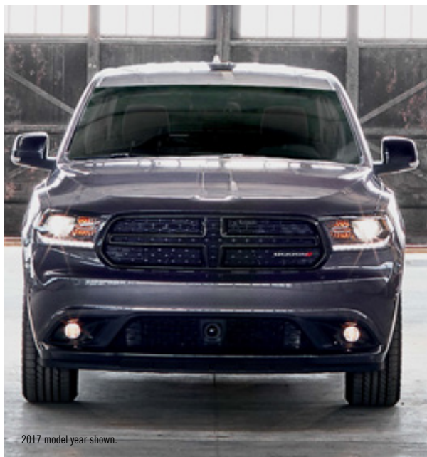
2017 model year shown.